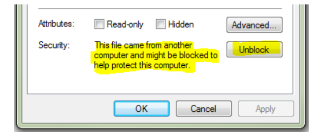
Figure 1 Shows the Zone Identifiers

NOTE: For automatic license installation to work, any Internet Zone Identifies on the 'License.license' file must be removed. i.e.